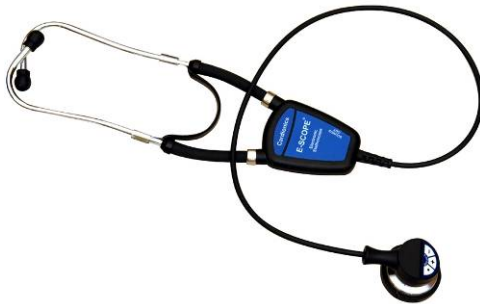
Figure 1 E-Scope II electronic stethoscope Clinical model

There are several models of the E-Scope II. The clinical E-Scope (cat. no. 718-7740, 718-7700) and the Belt model E-Scope for hearing impaired users (cat. no. 718-7750, 718-7710).