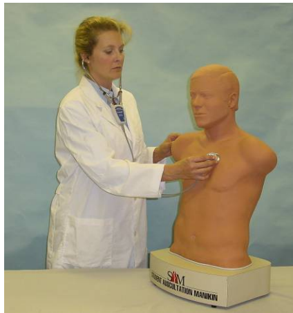
Figure 4 – Using the E-Scope