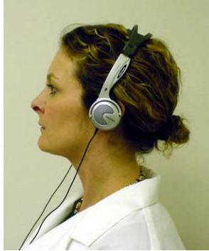
Figure 5. Over the head style headphone.

These headphones are designed for use with the E-Scope Belt model, cat. no. 718-7710 or cat. no 718-7750.