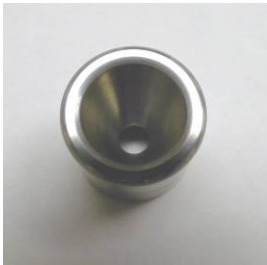
Figure 9 Specialist Pediatric Bell