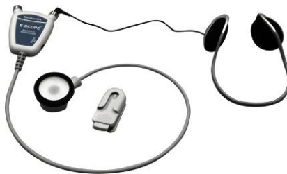
Figure 2 E-Scope belt model for hearing impaired users

The Belt model E-Scope is designed for use with an ITE (in-the-ear) type hearing aid. With the Belt model E-Scope, the normal earpieces have been removed. A pair of headphones are then inserted into the upper output of the E-Scope and placed over the hearing aids. Figure 2 shows the detail of the Belt model E-Scope and Figure 4 shows the E-Scope in use.