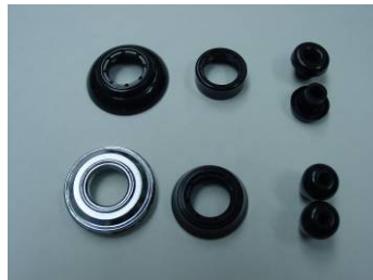
Figure 10 E-Scope Accessory kit Supplied with all E-Scopes

Upper row left – adult plastic diaphragm, upper middle infant bell, upper right, mushroom eartips; Lower row – Pediatric diaphragm, pediatric plastic bell, hard plastic eartips.