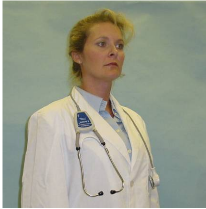
Figure 3 Wearing the E-Scope