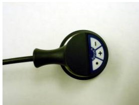
Figure 11 E-Scope Stethoscope head

3.1 Volume Adjust. The E-Scope volume may be increased or decreased by momentarily pressing the + or – button located on the stethoscope head. Pressing and holding one of these buttons for more than one second causes the volume to move up or down. It takes about seven seconds for this automatic adjustment to cover the full volume range of 64 steps. The E-Scope retains the last volume setting and reverts to that setting when the power is turned on.