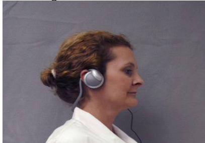
Figure 6. Behind the head style headphone.

These headphones are designed for use with E-Scope model 718-7710 and 718-7750. This style has a single cord and behind the head style fit.