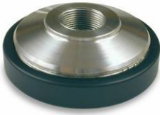
Figure 7 Specialist Adult Diaphragm

Accessory Pack. Each E-Scope is supplied with an Accessory pack that contains a pediatric diaphragm, plastic adult bell, plastic pediatric bell and plastic infant bell. These chest pieces can be used by replacing the existing chest piece by unscrewing. Additionally, this pack contains both mushroom and hard plastic ear tips. Inserting the mushroom ear tips will require a little force. The hard plastic eartips are self-threading. Place this eartip on the stethoscope binaural, press and with a twisting motion, screw them on.